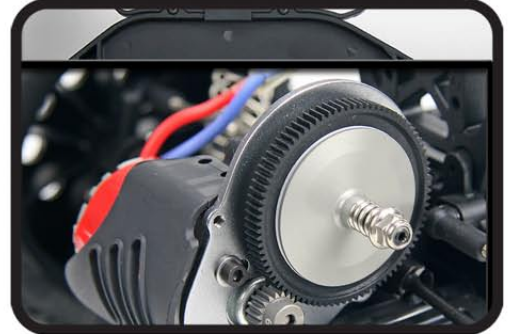
Slipper Clutch/48 Pitch Gearing