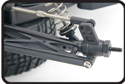
Rear CVAs with Bearings