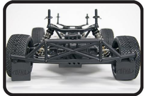
Rear Bumper with Mud Flaps