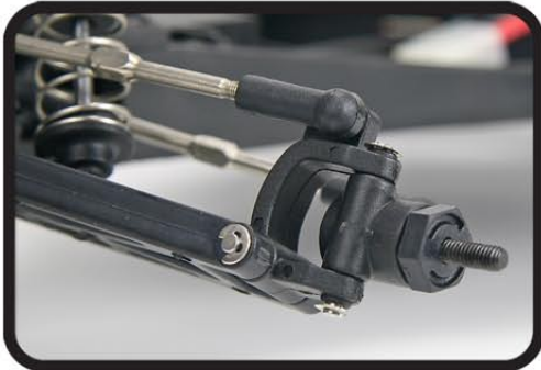
12mm Hexes with Bearings

Short Course has been in the game for some time and OFNA brought the first 4wd Pro Short Course to the world. Now OFNA opens itself to the 2wd class of SC with the TS2 RTR 2-Wheel Drive Short Course Truck. This RTR brings full race suspension performance just like its big brother PRO Edition. But this truck is ready to go right out of the box giving you the "Plug N Play" to hit the road. This stunning truck features a sharp looking painted body with impressive black mag wheels and deep treaded tires for that fast look. High quality and high strength composite materials provide unmatched durability on the track. Full bearings keep the SC moving freely, a ball differential and slipper clutch keeps the traction in control as they work in harmony with the motor to take on the speed and technical aspects of the tracks. Flexible front, rear and side bumpers provide the bump and run with your competitors as you dice it up for top spot supremacy. The OFNA TS2 RTR will sure offer more to the game and not just a little fun, but a "WHOLE LOTTA FUN!!!"