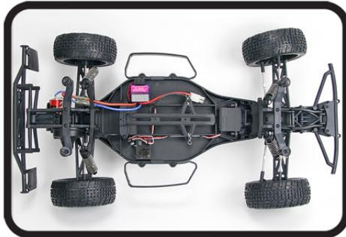
Electric Motor & Speed Control