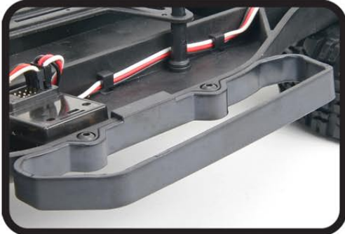
Side Impact Bumpers