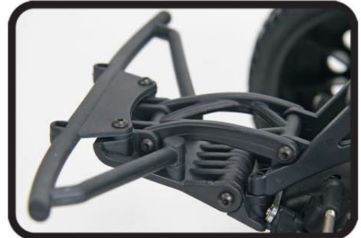
Pivot Style Front Bumper/Skid Plate